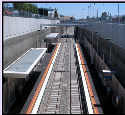
Photo of Lowered Rail Line at Mitcham Station, opened January 2014

Detailed works to support the level crossing removal will begin this year, with the separation of the railway line expected to begin in mid 2015, taking approximately 18 months to complete. Following is a detailed design stage and then construction. Timeline for major construction has not yet been determined.