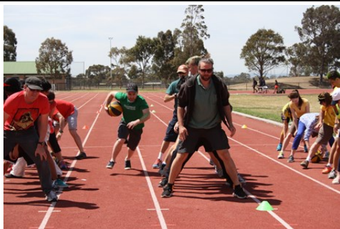
The staff versus student tunnel ball race was a highlight of the day congratulations to the O'Reilly team for coming in 1 st place.