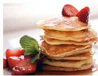
Renata Damasio www.flickr.com

Mỗi quý phụ huynh và học sinh đến dự bữa sáng mừng tại trường Catholic Regional College St Albans.